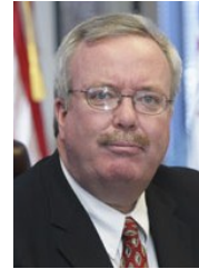
Mayor John McCormac